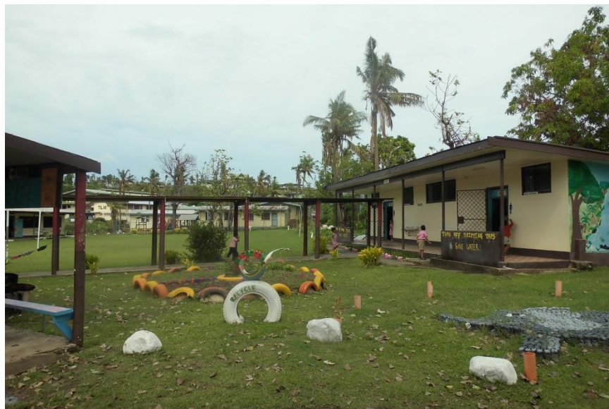
Covered walkway & Toilet Block (repaired)