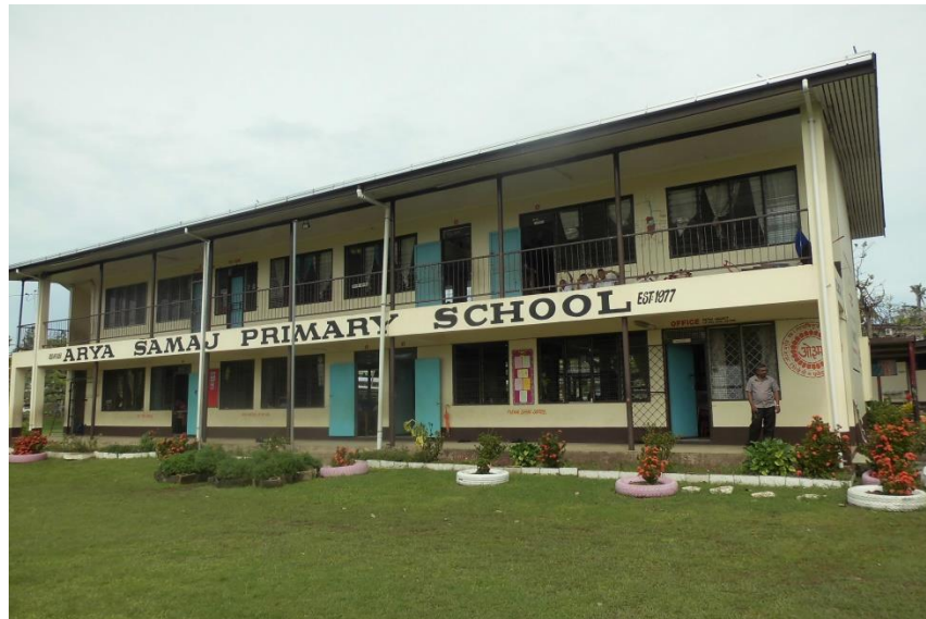
Block A (guttering repaired)